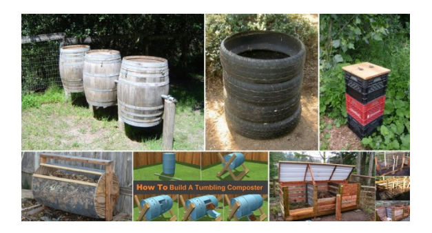
Build your Own Tumbling Composter - <u>HERE</u>