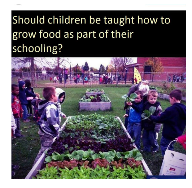
Learn more about VT Farm to School programs <u>HERE</u>

If you need a bit of inspiration, you can see what other MailChimp users are doing, or learn about email design and blaze your own trail.