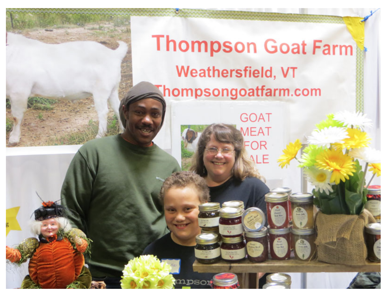
Flavors of the Valley - April 10 - Hartford High School - MORE here