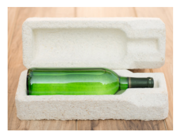
Goodbye Styrofoam - Hello Mushrooms? <u>READ</u>

You can create unique layouts by placing a variety of content blocks in different sections of your template.