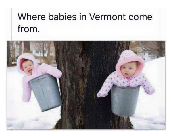
Only those born in March!