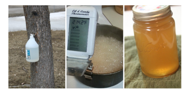
Tapping <u>birch</u> has become an emerging cottage industry. Read about 22 more trees to tap