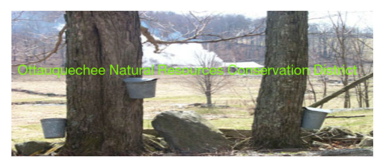
Public Meeting - March 24 - 6:30PM Martin Memorial Hall, Ascutney, VT

<u>View this email in your</u> <u>browser</u>