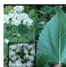
White Snakeroot ( Ageratina altissima )