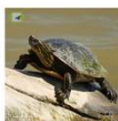
Eastern Painted Turtle ( Chrysemys picta )