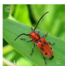
Eastern Milkweed Longhorn beetle ( Tetraopes tetraophterus )