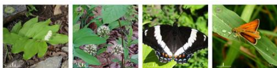
False Solomon's Seal ( Maianthemum racemosum )