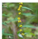
bluestem goldenrod ( Solidago caesia )